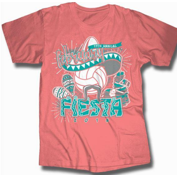
$20 – Comfort Colors

One Payment Per Team Due February 8 by mail if Not Paid Online at Time of Order