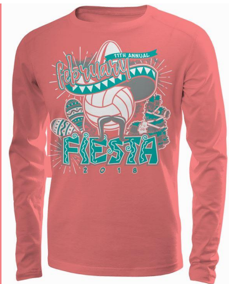
$25 – Comfort Colors